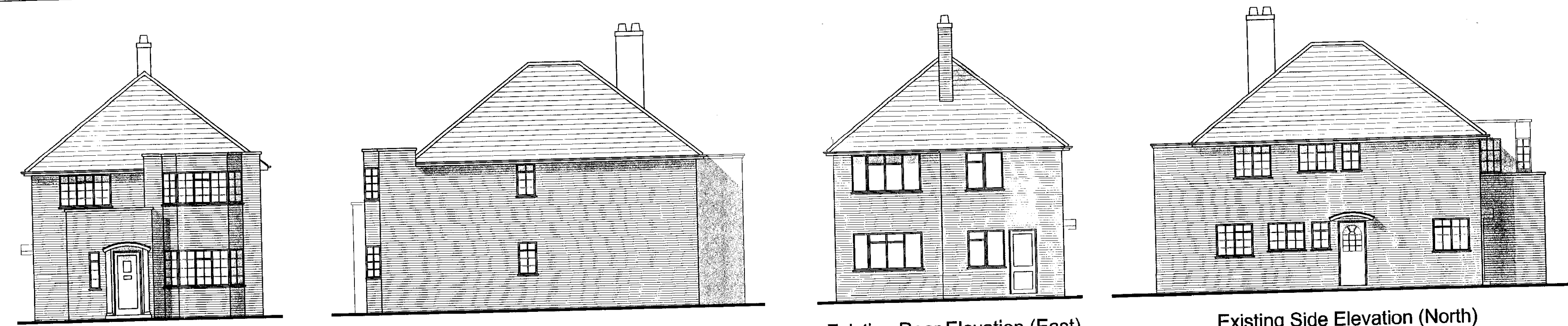
Existing Front Elevation (West)