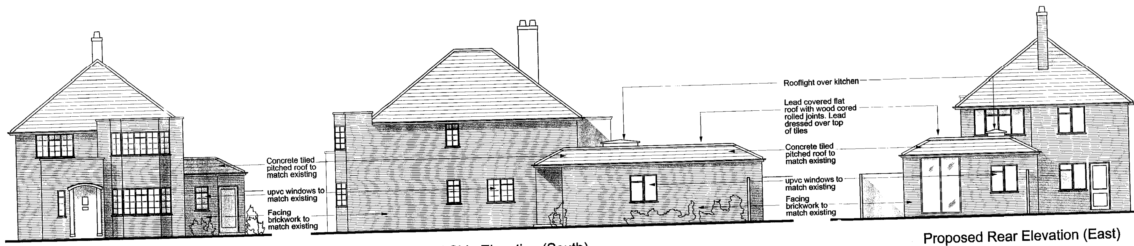
Proposed Front Elevation (West)