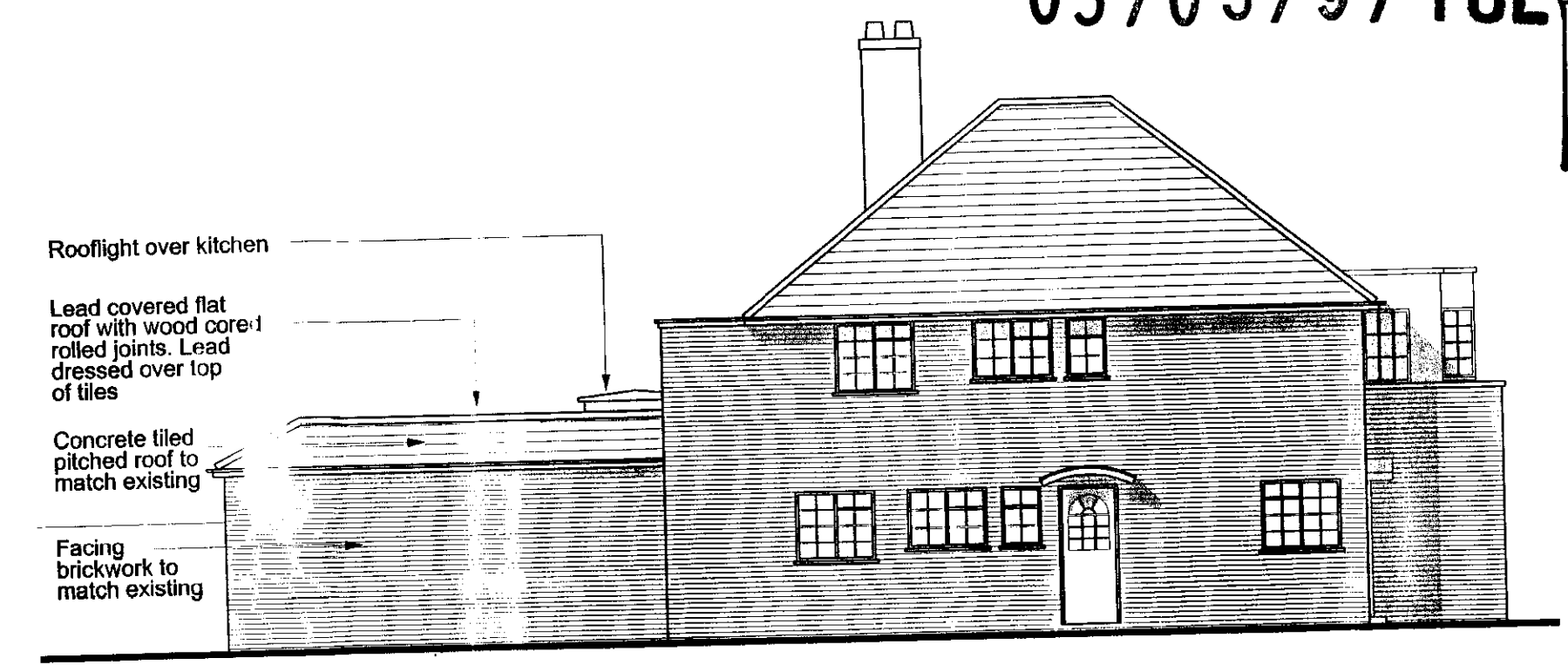
Proposed Side Elevation (North)